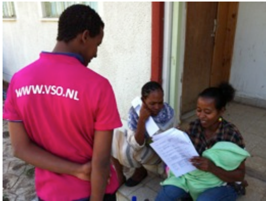
Training of data collectors & supervisors