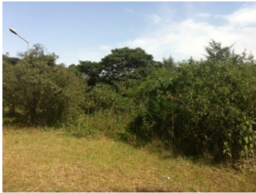
Location for the MWH behind obstetrics ward