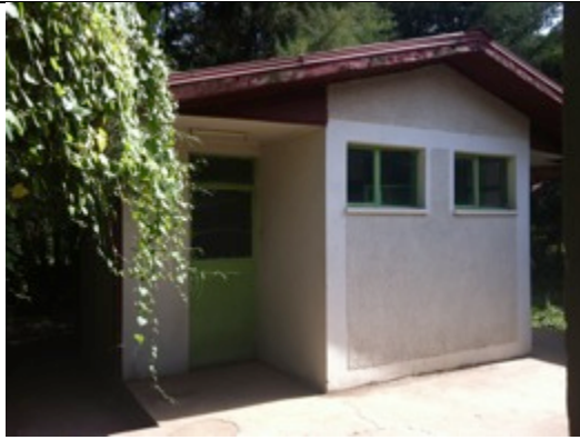
Existing toilets & showers will be renovated