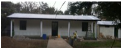
Finished MWH, kitchen, walkway