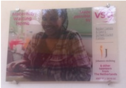
A "plaquette" on the exterior of the MWH to thank the Dutch sponsors