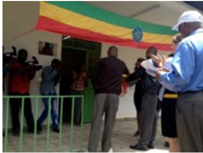
The official opening